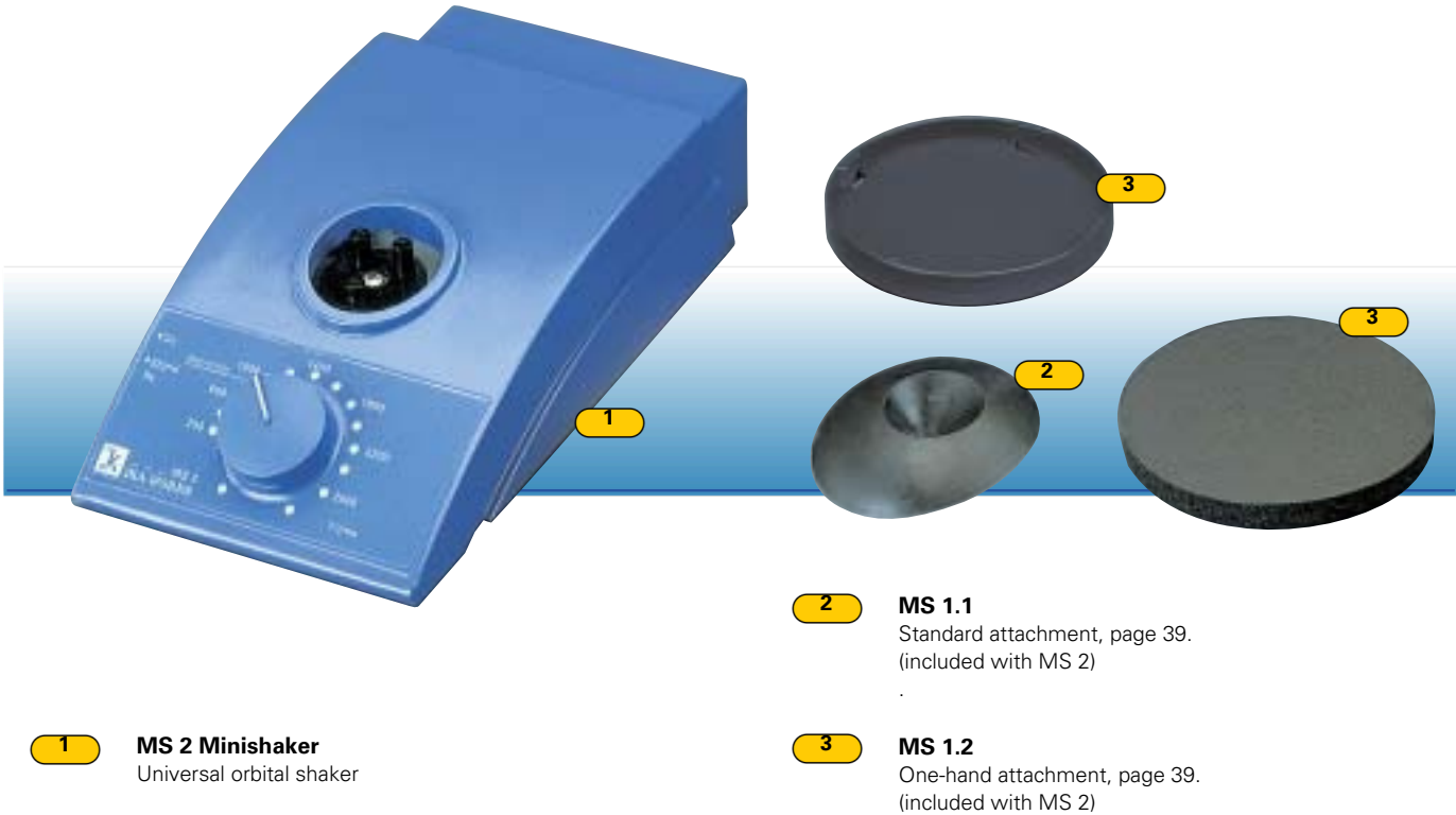
1 MS 2 Minishaker Universal orbital shaker