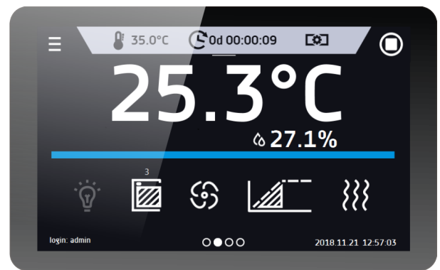
Smart PRO - preview screen