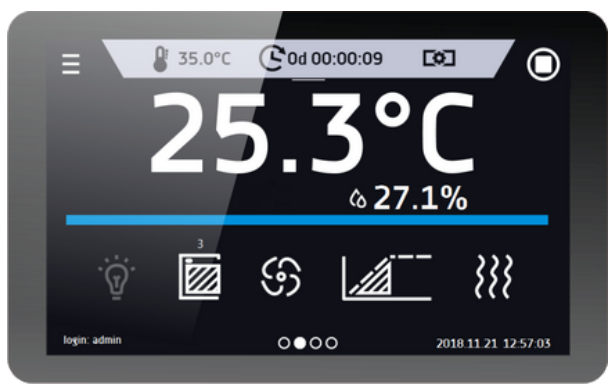
Smart PRO - preview screen