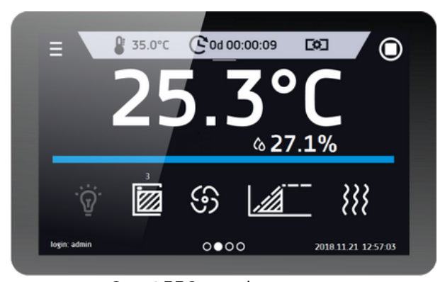
Smart PRO - preview screen