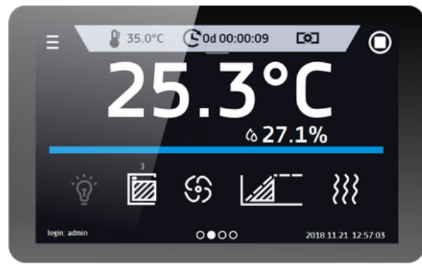
Smart PRO - preview screen