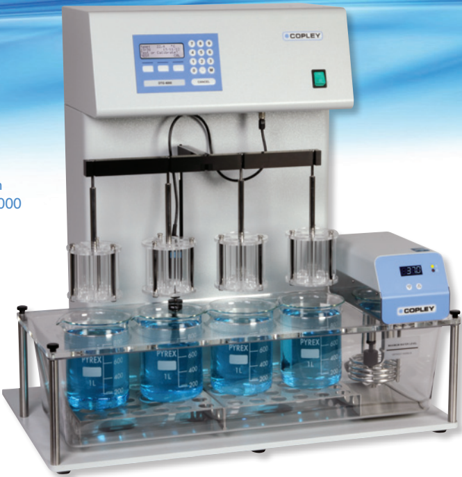
Disintegration Tester DTG 4000 ▶

This means that if it is necessary to disassemble the basket before cleaning, this can be done very quickly and without the use of any specialised tools.