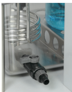
▶ Drain tap used on rear of DTG 3000 and DTG 4000 water bath

However, on this unit, each basket rack assembly can be controlled, started and stopped individually using separate membrane keypads.