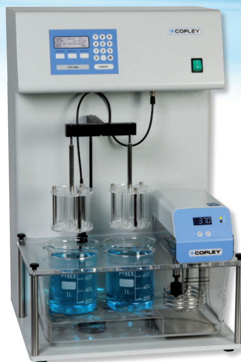
Disintegration Tester DTG 2000