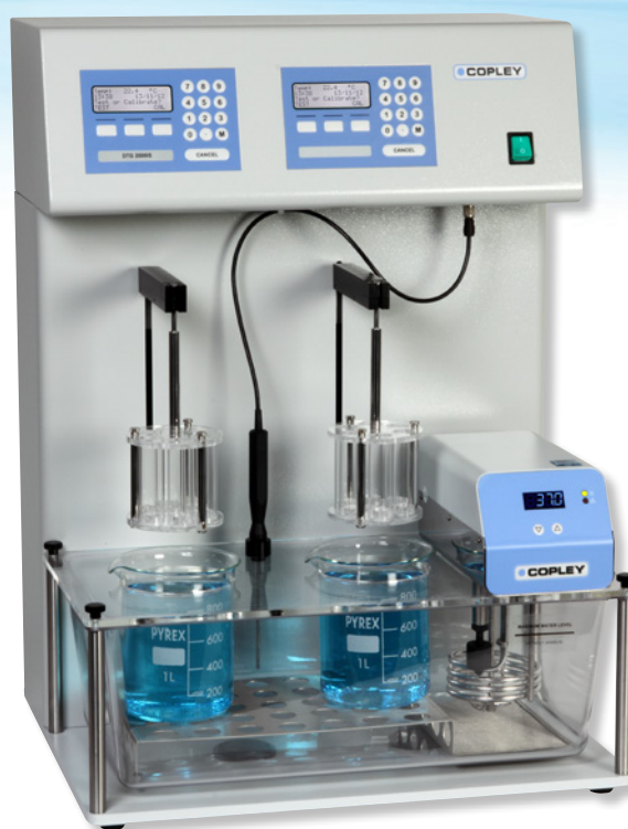
▲ Disintegration Tester DTG 2000 IS

This is particularly helpful in research and development when the user is comparing one formulation directly against another, or one formulation under varying conditions, or in the