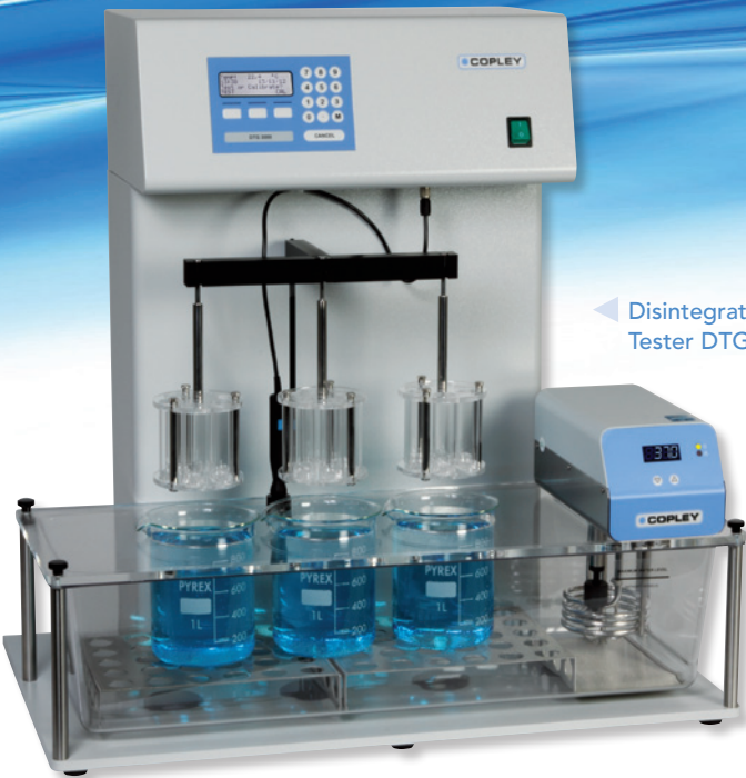
◀ Disintegration Tester DTG 3000