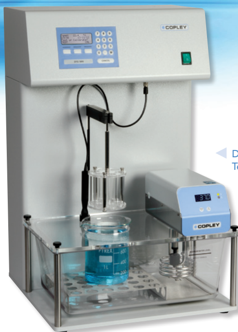
Disintegration Tester DTG 1000