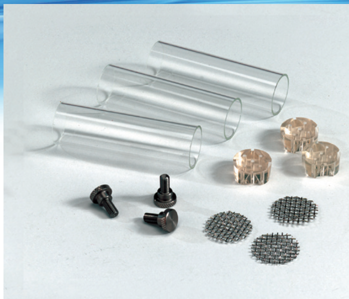
▲ Basket fitted with Special Cover